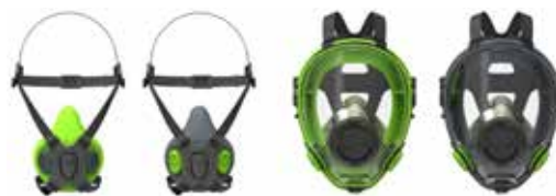
Half masks BLS 4000 S - BLS 4000R